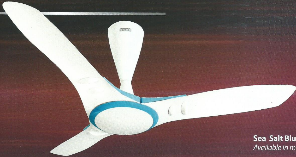
Sea Salt Blue Available in metallic finish