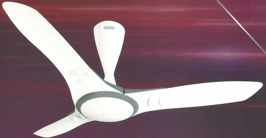
Sea Salt Grey Available in metallic finish