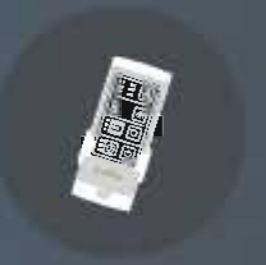
Touch Screen RF Remote

Even circulation of air takes the load off air conditioners, thus saving more energy.