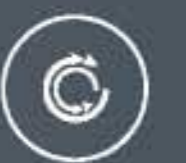
Bi-Directional Rotation for All-Weather Comfort

Blades run anti-clockwise in summers to blow air downwards and create a cooling breeze. In winters, clockwise movement of blades at low speed circulates the warm air downwards, warming up the area.