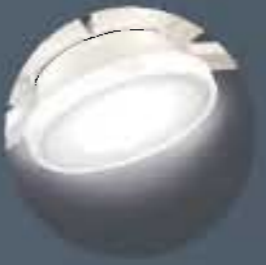
LED Light Hub

Specially designed blades allow air to spread consistently around the space and surroundings.