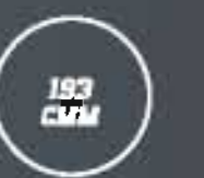
193 CFM Air Delivery