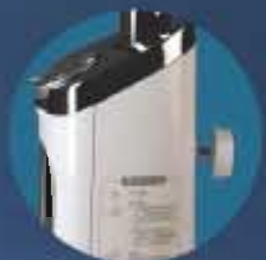
Height Adjusting Mechanism