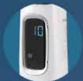
Super High Definition LCD Display