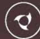
Uniform Air Circulation

The technologically advanced motor makes the fan whisper quiet.