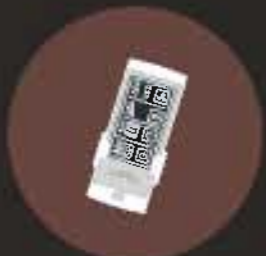
Touch Screen RF Remote