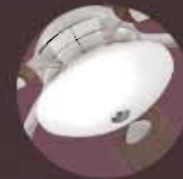
Incandescent Light Hub