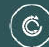
Bi-Directional Rotation for All-Weather Comfort

Even circulation of air takes the load off air conditioners, thus saving more energy.