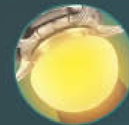
Halogen Light With Dimmer