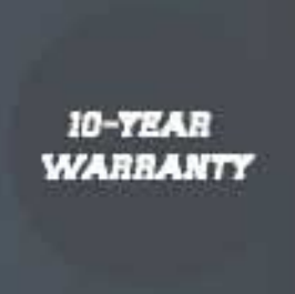
10-YEAR WARRANTY On BLDC Motor

Blades run anti-clockwise in summers to blow air downwards and create a cooling breeze. In winters, clockwise movement of blades at low speed circulates the warm air downwards, warming up the area.