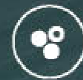
Intelli-Comfy Wind Modes

The BLDC motor saves more energy compared to conventional fans. Less consumption means less usage of electricity and less impact on environment.