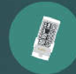
Touch Screen RF Remote