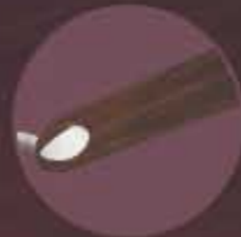
Walnut Finish Plywood Penta Blades With 52" Sweep Size