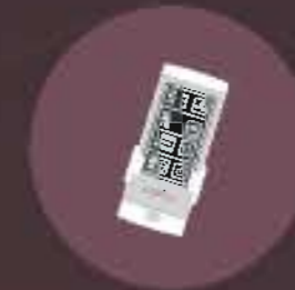
Touch Screen RF Remote