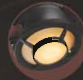
Halogen Light Hub