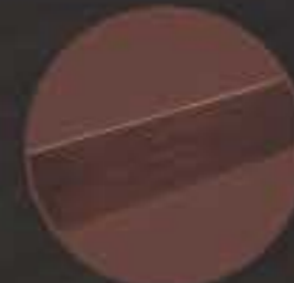
Unique Twin Plywood Blades With 52" Sweep Size