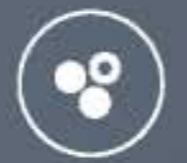
Intelli-Comfy Wind Modes

Three variable wind modes give you specialized comfort as per your preference: Normal, Sleep and Natural.