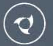
Uniform Air Circulation

The technologically advanced motor makes the fan whisper quiet.