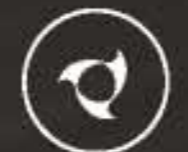
Uniform Air Circulation

The technologically advanced motor makes the fan whisper quiet.