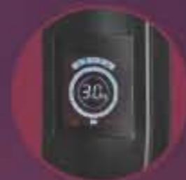
LCD Display Panel