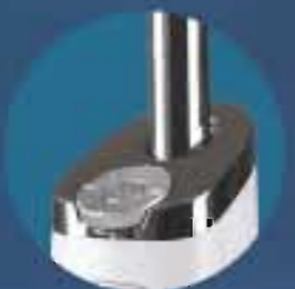
Central Dial For Easy Use