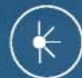
LCD Display Panels With Screen Off Feature

Four variable wind modes give you specialized comfort as per your preference: Normal (26 Speed steps), Sleep, Natural and Silent (8 Speed steps).