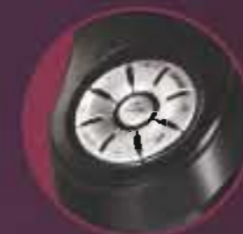
Ergonomically Placed Control Panel