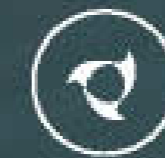
Uniform Air Circulation

The technologically advanced motor makes the fan whisper quiet.