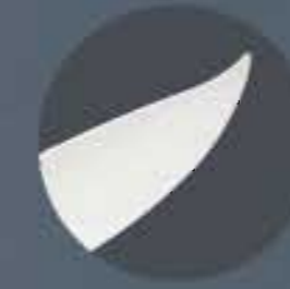
Pristine White ABS Penta Blades With 56" Sweep Size

The BLDC motor saves more energy compared to conventional fans. Less consumption means less usage of electricity and less impact on environment.