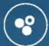
Intelli-Comfy Wind Modes

Infrared remote allows you to control the fan easily even from a distance.